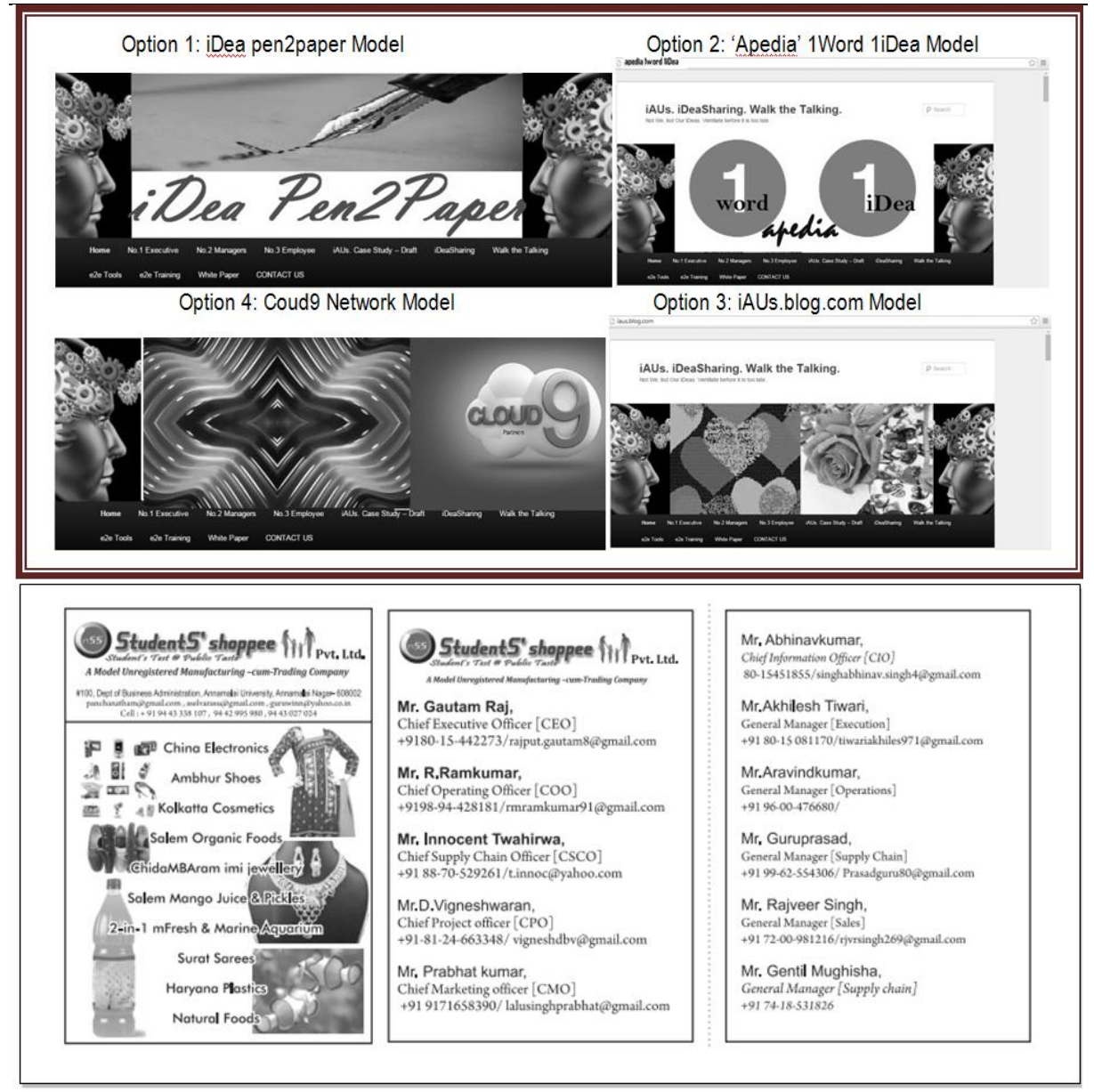
Figure 1 e2e Employee Communication optionsFigure 2 pen2paper: StudentS' shoppee

IOSR Journal of Business and Management (IOSR-JBM) e-ISSN: 2278-487X, p-ISSN: 2319-7668. PP 56-64 www.iosrjournals.org